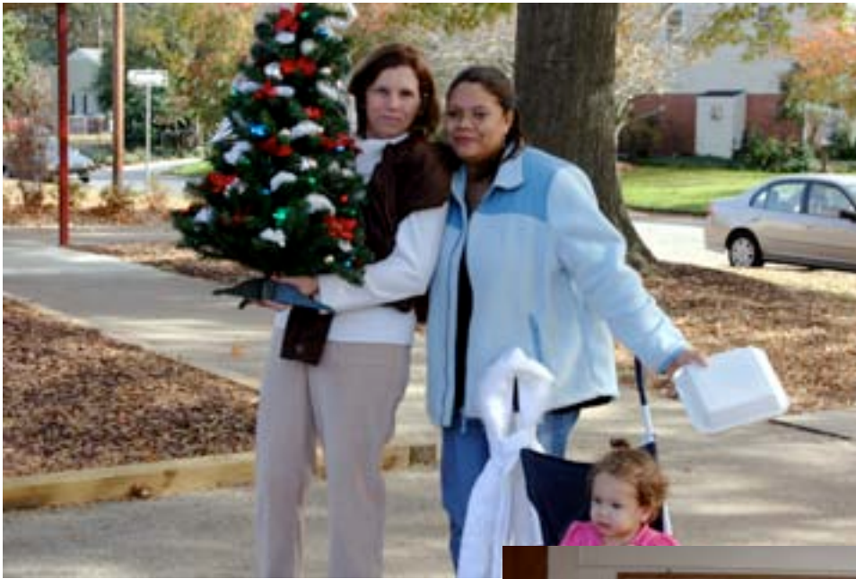
The food and the tree were good buys and da kid is happy too!